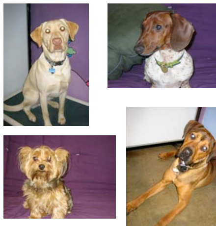
Dogs of the month (from top left, clockwise: Mini Cooper, Jasco, Mirabelle, and Maggie).

You can start spyin' on your pup in the third week of May 2006. You will be able to access the cameras on our website ( www.happyhound.com ), between 10 AM and 3 PM seven days a week.