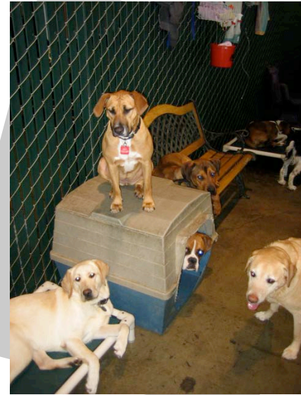
Thanks guys! We appreciate you!