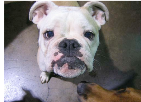
Check my teeth, Mama!

This special, individualized service is offered on the fourth Wednesday of each